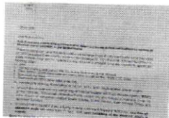
IMG2024062... .jpg 5.8MB

▲ This email was moved from Spam folder. Attachments may contain harmful content.